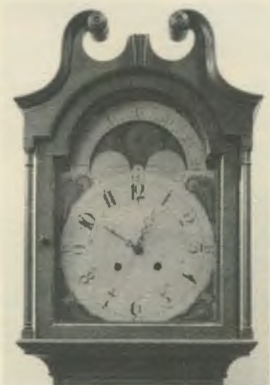
Porte Crayon's clock, see story, page 1.

camp, agricultural work, individual and group portraits, landscapes, and house exteriors and interiors. There are also labels without associated photographs. The majority of photographs are not identified. Also includes original containers of photographs (which were originally commercial packaging for Kodak sensitized paper).