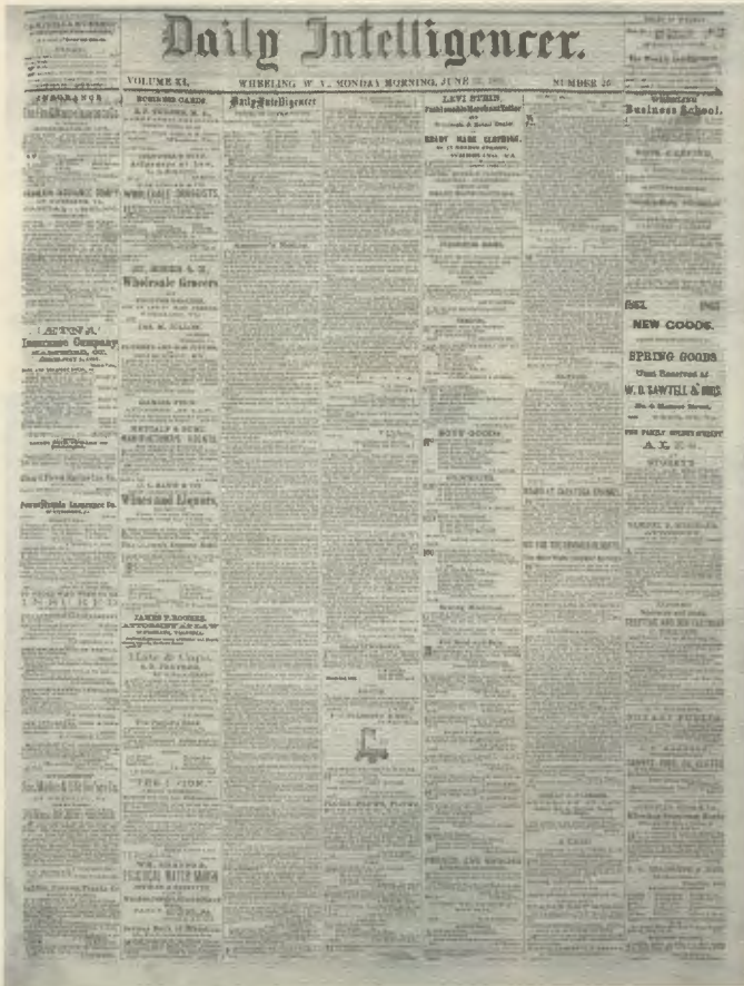
The first issue published after West Virginia officially entered the union, the June 22, 1863 edition of the Daily Intelligencer reported the very first steps of the fledgling state, noting celebrations and proceedings of the new state legislature two days earlier.