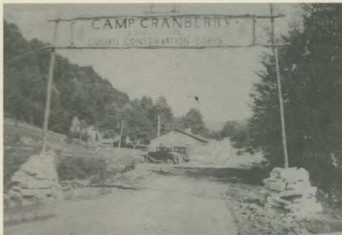
Civilian Conservation Corps Camp Cranberry, Webster County, ca. 1935.