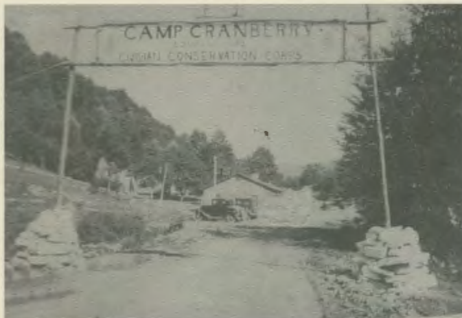
Civilian Conservation Corps Camp Cranberry, Webster County, ca. 1935.