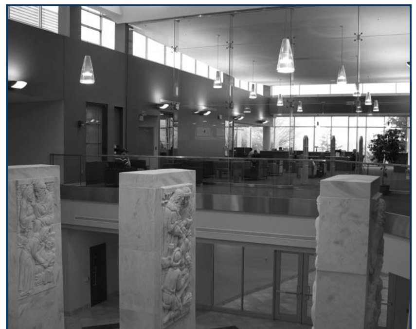
The landmark Pylons serve as a centerpiece for the new Health Sciences Library and Learning Center.