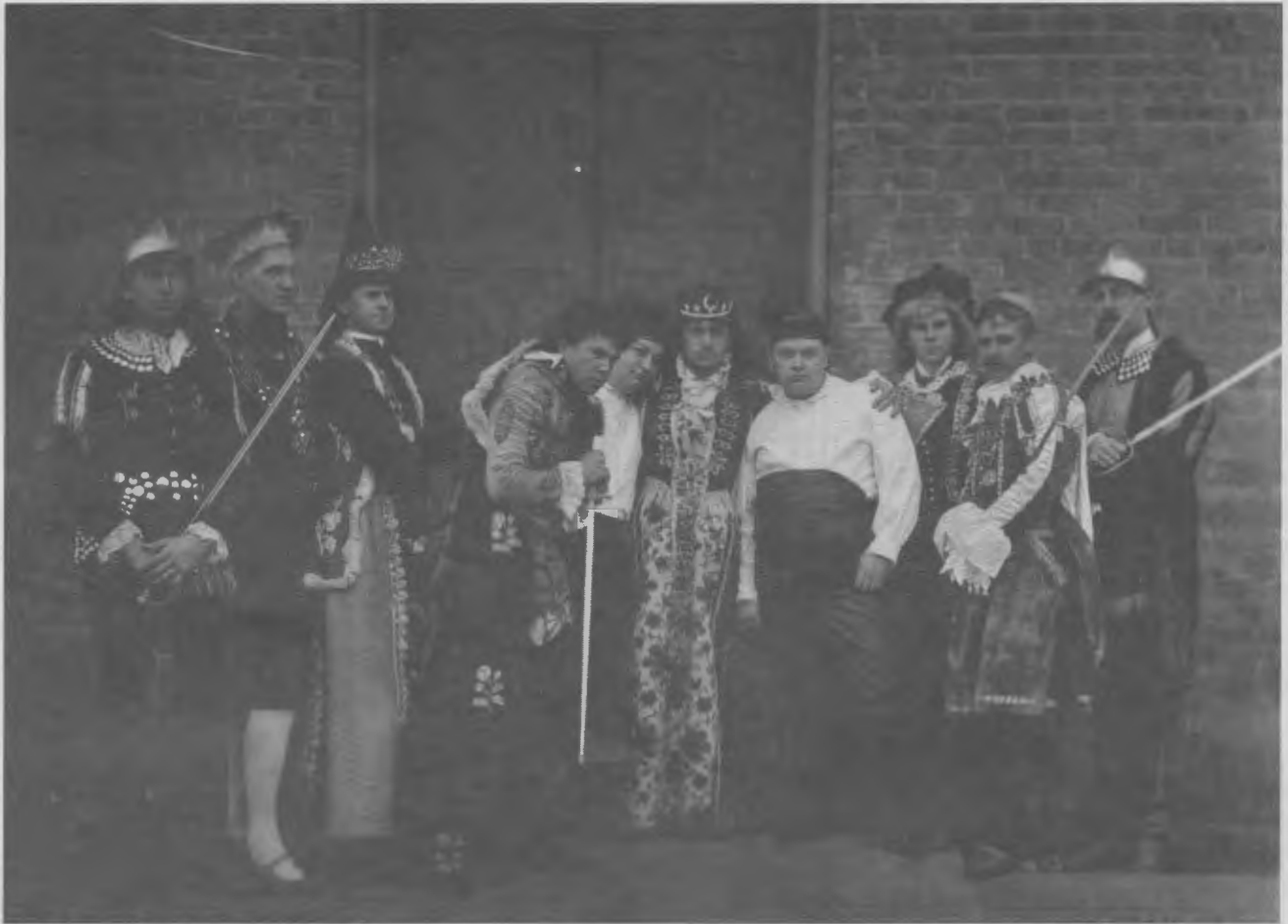
Post (4th from left) directed and starred in a presentation of Shakespeare's Richard III organized to raise funds to outfit WVU's first football team in 1891.

a degree in law. Completing the degree in May 1892, he found immediate employment as a prosecuting attorney in Wheeling. While his career in criminal law would be relatively short-lived, his exposure to crimes, criminals and criminology during this period would provide a foundation for his true calling.