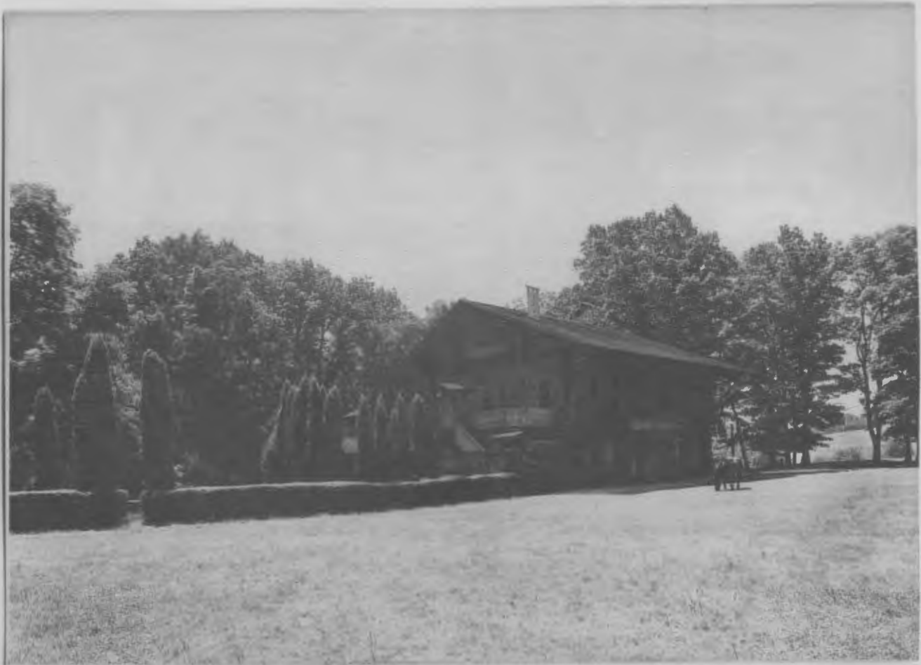
The Chalet on the Hill of the Painted Men ca. 1930. Post spent the better part of a decade traveling the world before returning to the beloved land of his birth in 1914. In Dwellers in the Hills he wrote: "It is a wonderful thing how the frost glistening on a rail, or a redbird chirping in a thicket of purple raspberry briars, can lift a heart into the sun."