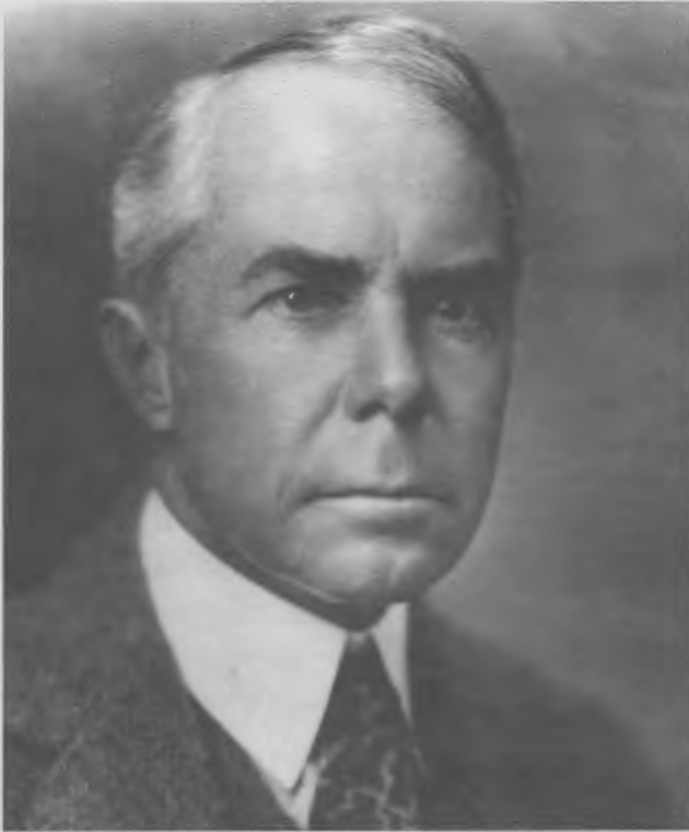
Melville Davisson Post, ca. 1929. The author had plans for several future works when he died twelve days after falling from a horse in 1930.

Post's highly original new crime solver was an instant hit with the nation's mystery readers. The author would feed their appetites with many more Uncle Abner stories in the months and years that followed. A gathering of eighteen were published in a collected edition titled, Uncle Abner, Man of Mysteries (New York: D. Doubleday) in 1918. Critics of the genre, then and now, agree that this volume is among the finest collections of short mysteries ever written by an American author. Ellery Queen considered Uncle Abner second only to Edgar Allen Poe's "Dupin," who untangled the Murders in the Rue Morgue . Willard Howard Wright, creator of the renowned detective "Philo Vance," placed Uncle Abner on an equal footing with Sherlock Holmes. Howard Haycraft, a towering figure in publishing and scholarship in this genre declared, "No reader can call himself a connoisseur who does not know Uncle Abner backward and forward."