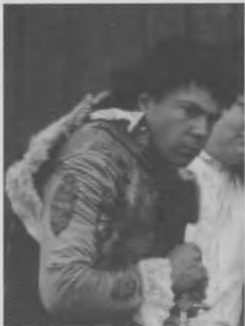
The mysterious Melville Davisson Post, see story, page 1.