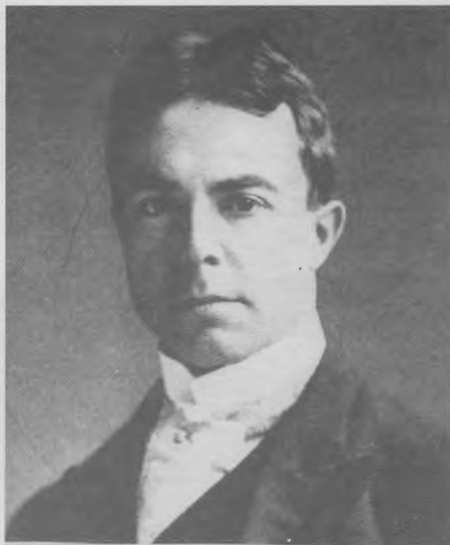
Melville Davisson Post (1869-1930)

An extensive collection of Post's personal and professional papers recently acquired by the Regional History Collection affords considerable insight into the world of