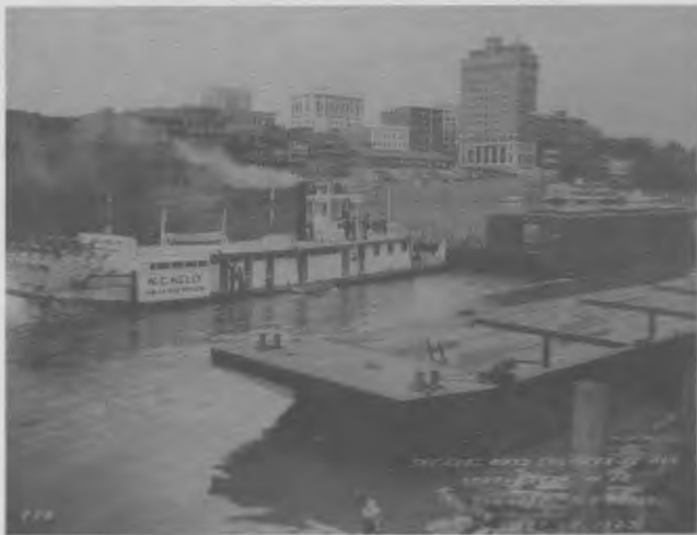
Tugboat W. C. Kelley, Charleston, WV, May 29, 1923.