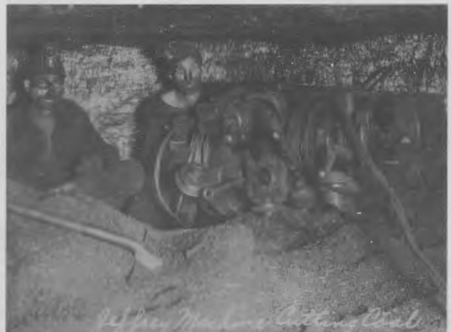
Miners with Jeffrey coal cutting machine ca. 1930.

Photographic postcards documenting the C.H. Mead Coal Company, a mining company located in the Winding Gulf Coalfield in western Raleigh County and eastern Wyoming County, southern West Virginia. Includes 72 postcards issued by the Company in the 1930s in a numbered series to publicize their facilities and activities. Subjects of images include industrial infrastructure, equipment, offices, coal transport, housing, schools, stores, hospital, and portraits of managers. Some facilities are specifically identified as African-American. Of the numbered series of 77 postcards in this collection, numbers 1, 5, 13, 29, and 40 are missing. There are also seven photographs of similar subject matter,