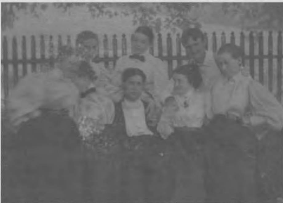
Melville Davisson Post, center, possibly with school mates at the Buckhannon Normal and Classical Academy, ca. 1885.