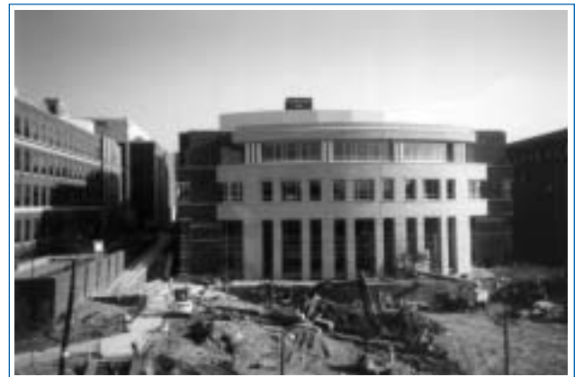
Crews apply the finishing touches to the face of the library.

funds to furnish the new and renovated facilities. Donors to the WVU Library Special Initiative will have their name linked to the furniture their gifts enable the library to purchase. Naming opportunities range from $150 for reader chairs to $5,000 for study carrels and information kiosks.