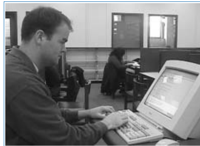
A student searches for material posted on the Electronic Reserves.