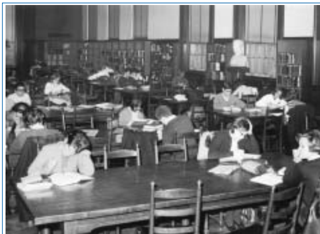
In the past, students would gather in a reading room in Wise Library to study material placed on reserve by their instructors.

Colson Reserve Library serves as a depository for homework problems, past exams and required and supplemental readings provided by faculty. The Libraries have worked with faculty on this service to students since the opening of the University Library in the early 1930's.