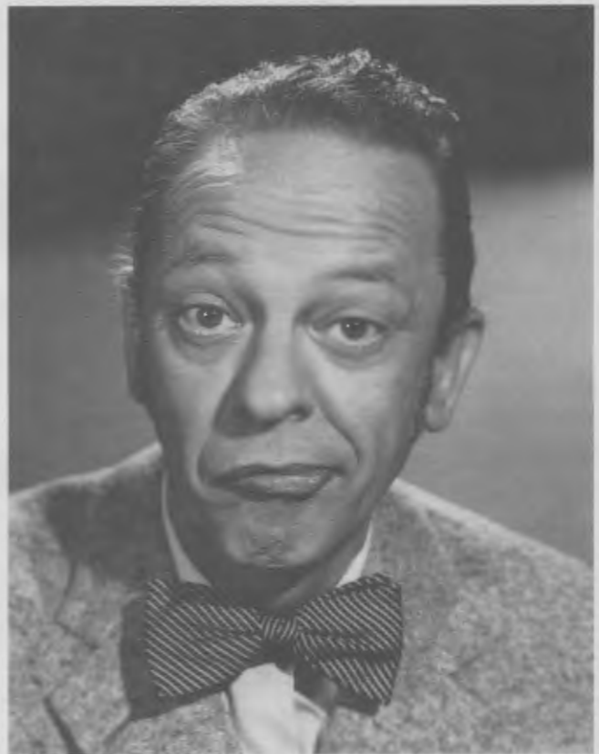
The Incredible Mr. Knotts

Born in Morgantown in 1924, Knotts' life-long career in show business began when he was just a lad. He was still in grade school when he began performing locally as a ventriloquist, an act that he hoped would one day bring him to fame and fortune. Towards this end, he headed to New York City immediately upon graduating from high school but quickly found that he was ill-prepared. After just a few weeks he traveled back to Morgantown and enrolled in West Virginia University's theater program which was then offered through the