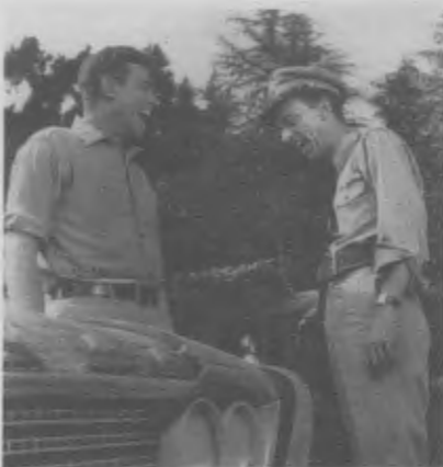
Sheriff Taylor and Deputy Fife enjoy a laugh, see page 1.