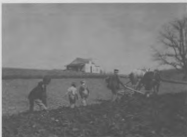
Plowing the fields in Arthurdale, WV, ca. 1935.

Photographic negatives and prints documenting the facilities, people, and activities at Arthurdale, West Virginia, the first of many New Deal planned communities established under the administration of U.S. President Franklin D. Roosevelt. Also includes an oral history transcript, a scrapbook of photographs, and mounted photographs of Arthurdale facilities and local coal mining.