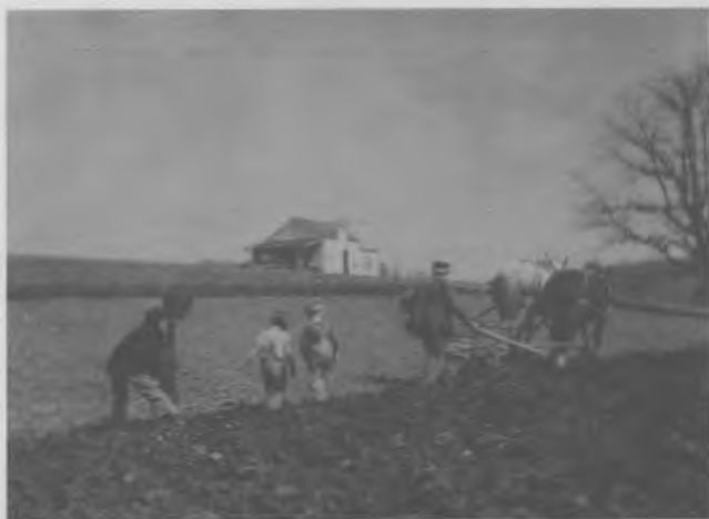
Plowing the fields in Arthurdale, WV, ca. 1935.

Photographic negatives and prints documenting the facilities, people, and activities at Arthurdale, West Virginia, the first of many New Deal planned communities established under the administration of U.S. President Franklin D. Roosevelt. Also includes an oral history transcript, a scrapbook of photographs, and mounted photographs of Arthurdale facilities and local coal mining.