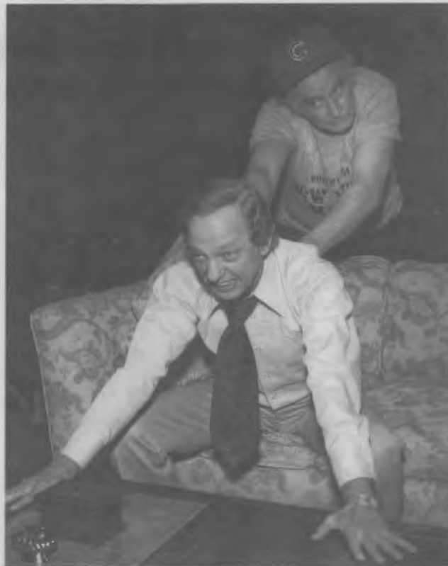
Knotts and Art Carney fool around on stage in The Odd Couple , ca. 1985.

Knotts' success and high level of activity in both film and television continued in the decades