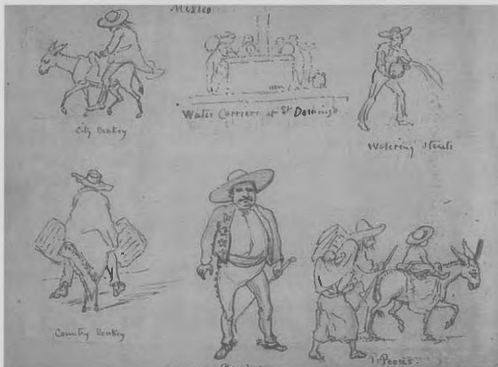
David Hunter Strother, Mexico sketches, ca. 1880.

The Consul's official writings, however, are dwarfed in scope, scale and content