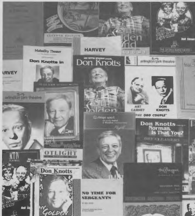
A selection of theater programs from the Don Knotts Collection.

Despite his widespread fame and travels, Knotts never lost touch with his hometown of Morgantown, returning frequently for reunions and special events, many of which were held in his honor. Nor did he forget his alma mater. Shortly before his death, the actor donated an assortment of personal archives and memorabilia to the West Virginia and Regional History Collection. Included in that gift were scripts to several of his favorite