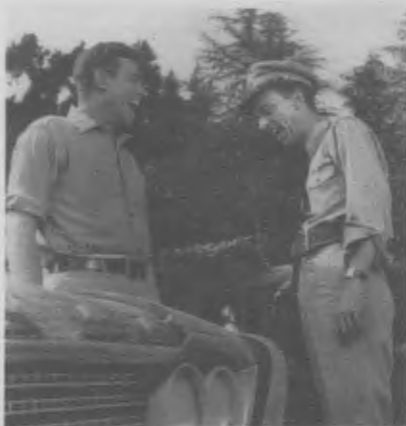
Sheriff Taylor and Deputy Fife enjoy a laugh, see page 1.