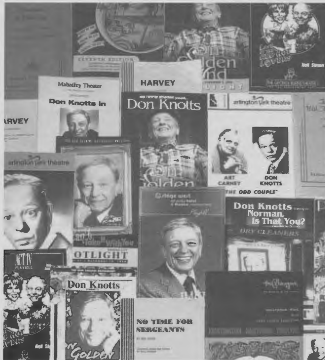
A selection of theater programs from the Don Knotts Collection.

Despite his widespread fame and travels, Knotts never lost touch with his hometown of Morgantown, returning frequently for reunions and special events, many of which were held in his honor. Nor did he forget his alma mater. Shortly before his death, the actor donated an assortment of personal archives and memorabilia to the West Virginia and Regional History Collection. Included in that gift were scripts to several of his favorite