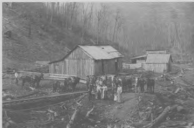
Helvetia area logging scene, ca. 1900.

Glass plate negatives of photographs taken by Uriah C. Shock documenting Helvetia, West Virginia, a small community of German-speaking Swiss immigrants located in Randolph County. Includes portraits of individuals and groups of family members and community groups. Many images feature woodland settings, and some include logging operations, horse teams, buildings, and livestock.