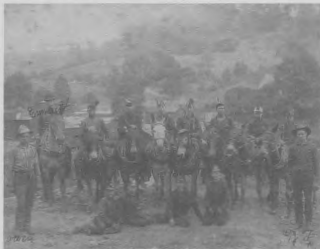
Coal miners and mules, Wolf Summit, WV, 1902.