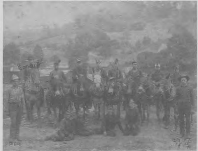
Coal miners and mules, Wolf Summit, WV, 1902.