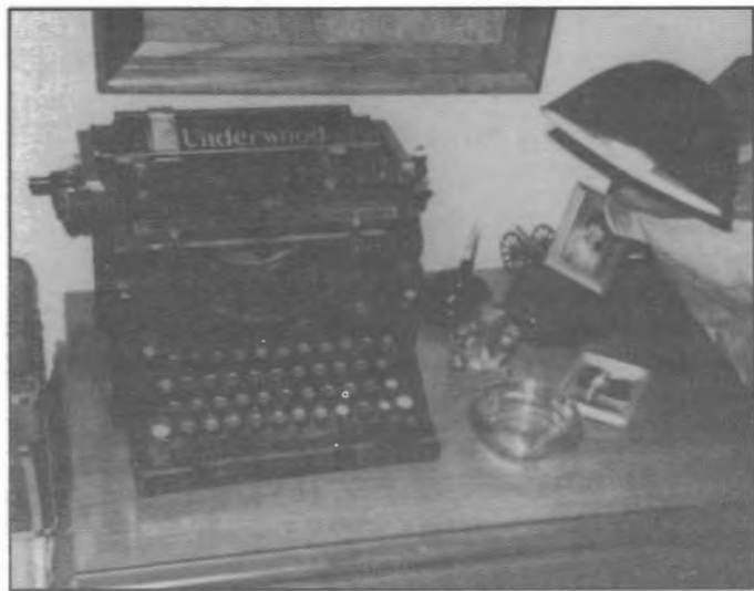
Pancake’s 1920-vintage Underwood typewriter.

It was at the University of Virginia that Pancake also became familiar with another fellow West Virginian, Mary Lee Settle. As Settle was already an accomplished author and a member of the University faculty, he was a little embarrassed at not having known of her work beforehand. He even-