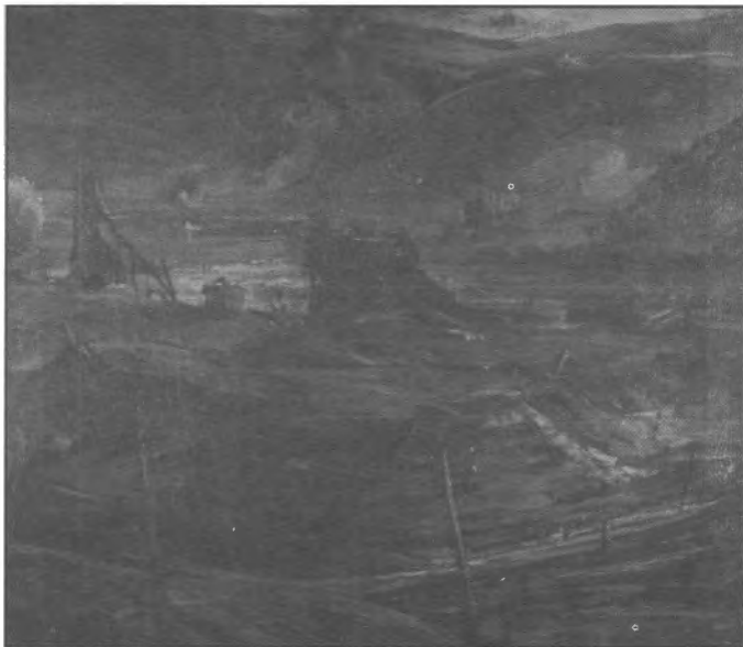
Virginia B. Evans, Ohio Valley Landscape , oil on canvas, 24" x 26," ca. 1930.