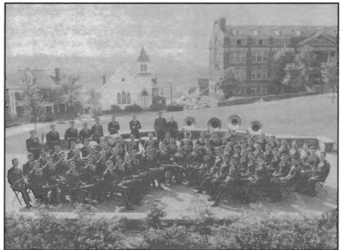
The 1948 WVU Marching Band.