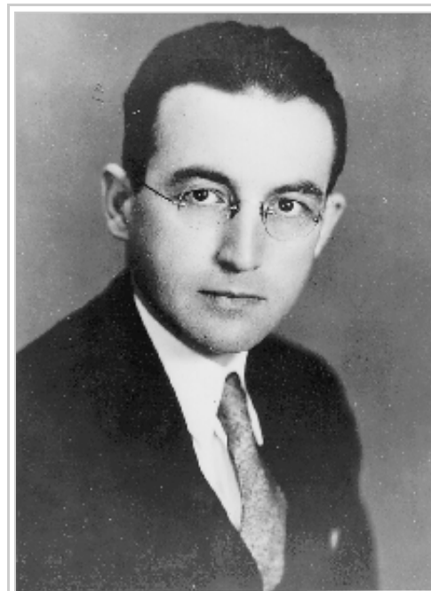
Arthur J. Altmeyer, probably during the 1920s.